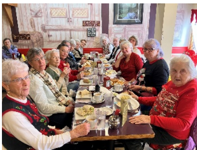
Trinity St Stephen's UC Amherst, NS