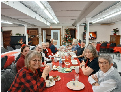
Community Christmas Dinner 2024 Beachburg, ON

This is just a few of the pictures. More can be seen on our Facebook page – National United Church Women.