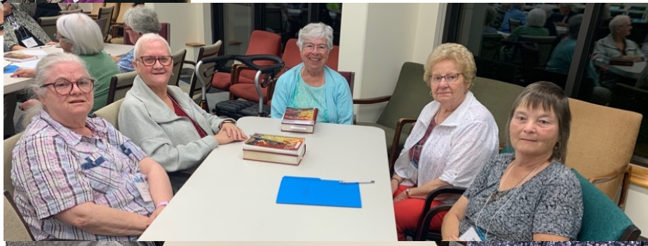
Working groups photos courtesy of Debbie Hawkins

Deadline for submission for our January 'Keeping in Touch' issue is January 15, 2025